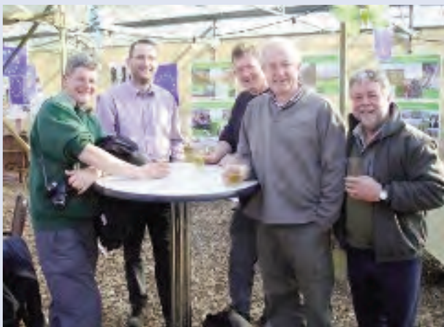
English nature conservation managers enjoying a drink during their visit to Feels Like Home.

Visit the LIFESCAPE website: www.lifescapeyourlandscape.org