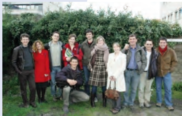
The refresher course participants and trainers.