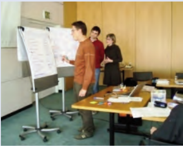
Group work during the course in Tilburg.

communication skills through facilitation, specifically workshops and multistakeholder groups in countries.