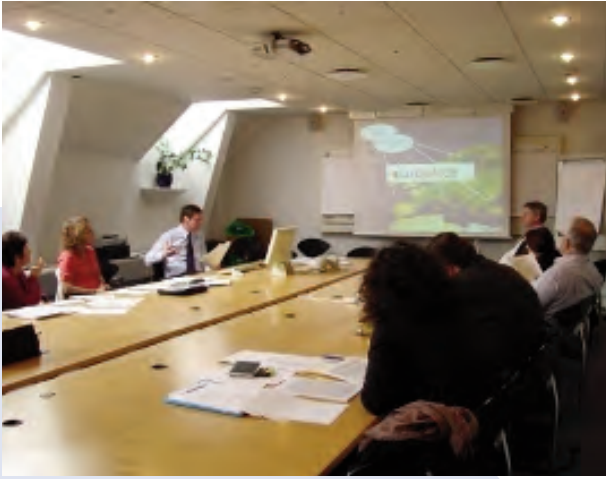
ALTER-Net NAC meeting.

ALTER-Net Council during its annual meeting on 23 and 24 April 2008 in Brussels. The Council favours continuing a science-policy interface in the next stage of ALTER-Net and feels that an ad-hoc think-tank should be created for this. At the Council meeting, all parties expressed commitment to continue participating in ALTER-Net beyond its initial five years with funding from the Commission. The Council agreed on a draft Memorandum of Understanding for this future and explored possibilities to ensure funding.