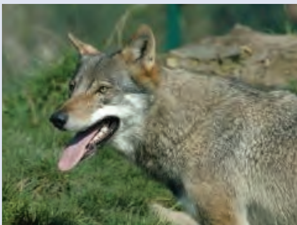
Grey wolf.

Most large European carnivores are threatened land species. In addition to the usual threats, such as reduction of habitat and poaching, carnivores are threatened by the 'human-carnivore conflict'. How can people and carnivores live together without