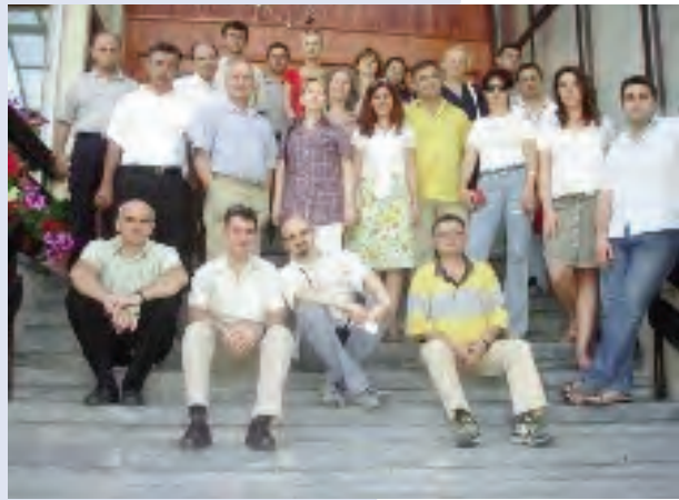
Workshop participants at Mavrovo National Park.