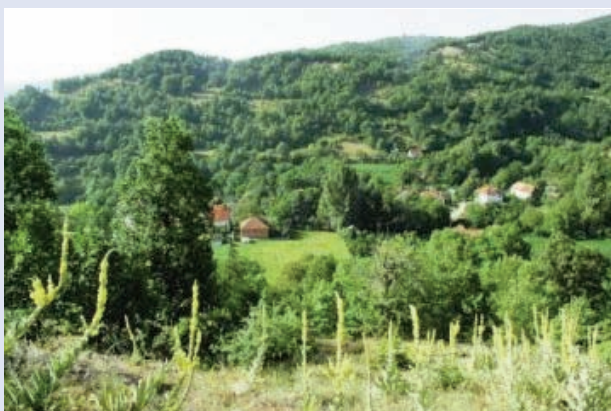
Samokov, FYRO Macedonia.

The last phase of this project, funded by the Norwegian Government, was finalized in September 2008. The main objective of the last phase was to strengthen the capacity in communicating for nature conservation by training the trainers in South-East Europe, with a special focus on Croatia and FYRO Macedonia. These trained partners acquired the skills needed to train fellow conservationists from public and non-governmental bodies working in the field of nature conservation. In this way the project achieved its aim of extending the knowledge and capacity in the country as well as beyond the project.