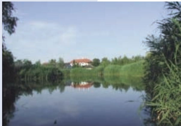
Aranypony fishponds.