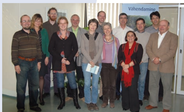
The ETC/BD Management Committee.