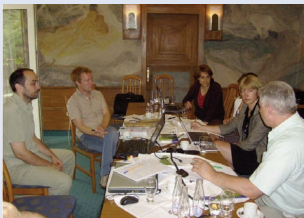
BTAU project team members.