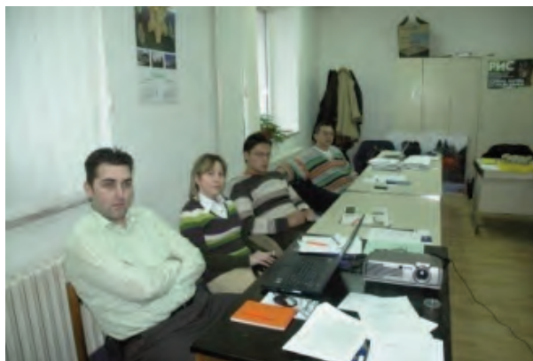
Kick-off meeting at Mavrovo National Park Headquarters, FYRO Macedonia.