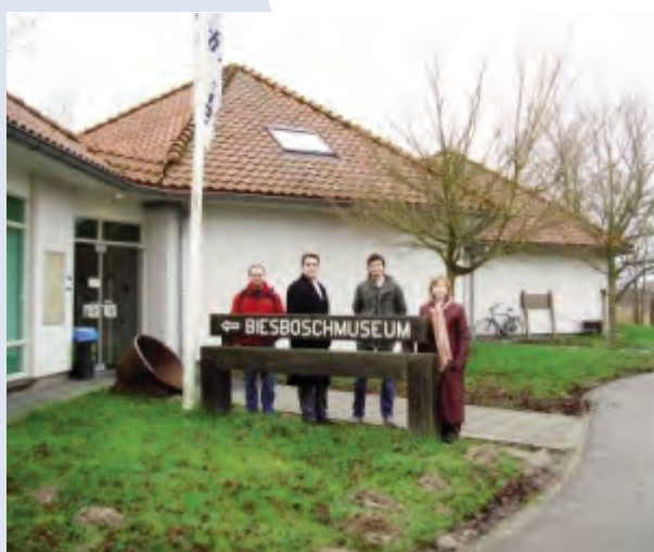
At the Biesbosch museum.