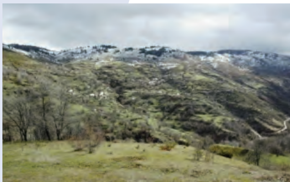
Korab Mountains near the village of Bibaj in Mavrovo National Park, FYRO Macedonia.