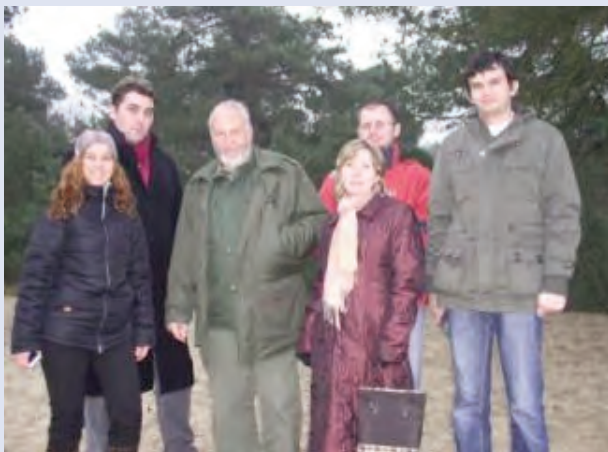
Visiting the Loonse en Drunense Duinen.