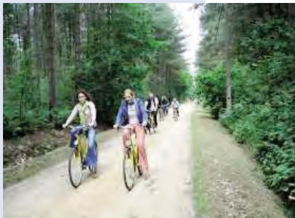
Recreation and tourism can be good for the rural economy.

These LIFESCAPE outputs show that investing in sustainability projects and nature and landscape is very profitable for the rural economy. Also, through an innovative financing instrument, funding streams can be made available for landscape conservation activities, while the scheme also benefits the participating bank and the supporting local authorities, companies and private persons.