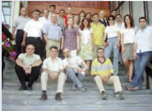
Workshop participants at Mavrovo National Park.