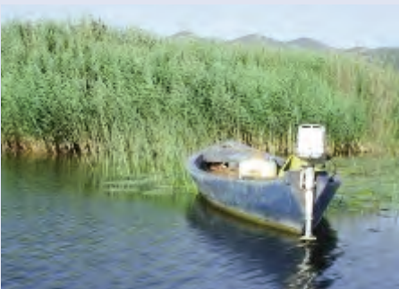
Neretva Delta.

On 18 and 19 June 2007 ECNC's project team met stakeholders at the Neretva Delta, Croatia. The workshop participants received training in stakeholder participation techniques and there was also an opportunity to develop the nature conservation 'vision' for the Delta.