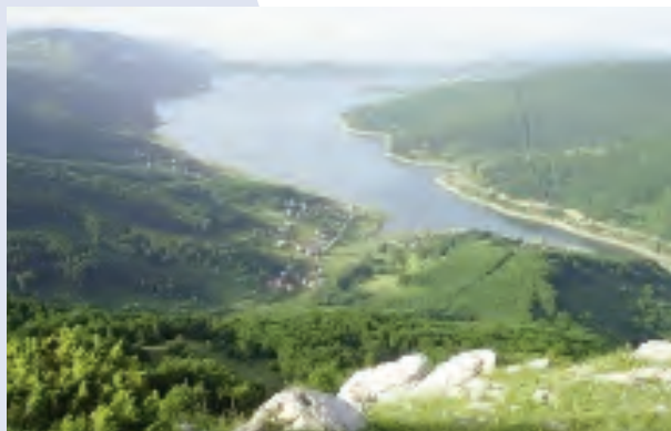
Mavrovo National Park.

The second workshop was held in Mavrovo National Park, FYRO Macedonia, on 21 and 22 June and was attended by over 30 participants. The participants were pleased to be part of the management plan of the National Park. During the workshop they collaborated in developing their visions and learned advanced techniques of stakeholder participation and facilitation processes.