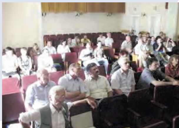
Workshop participants.

More than 50 scientists and researchers met for a two-day workshop in Kyiv, Ukraine, on 3 and 4 July 2007 as part of the ECNC-coordinated project 'Supporting public involvement in building capacity for Ukrainian biodiversity monitoring'. It was the first time that people active in biodiversity monitoring in the Ukraine had come together to hear about the project; to listen to a series of excellent presentations about current progress in the field; and, in some cases, to meet each other for the first time.