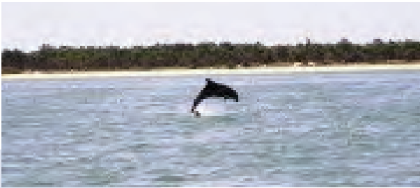
Dolphin off the coast of Portugal.

NatureNet Europe is encouraging its member organizations to prepare national activities and campaigns in the framework of the Year of the Dolphin.