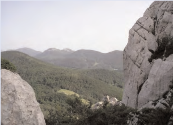
Velebit Mountain.

A workshop focusing on the techniques used for managing and facilitating consultation processes, and the development of communication strategies was organized by ECNC, in association with the Croatian State Institute for Nature Protection, in Velebit National Park, Croatia.