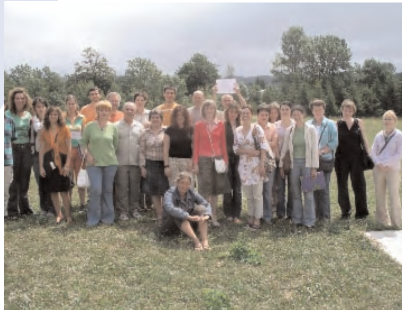
The workshop participants.