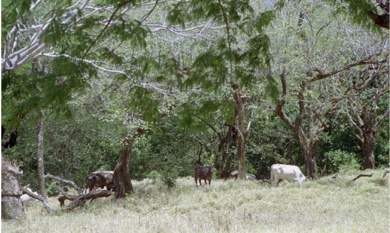
Photo 1: Silvopastoral systems, in which pastures include significant tree cover, tend to be more productive and to provide a much better habitat for biodiversity. Here, cattle graze in pastures with high tree cover in Esparza, Costa Rica.