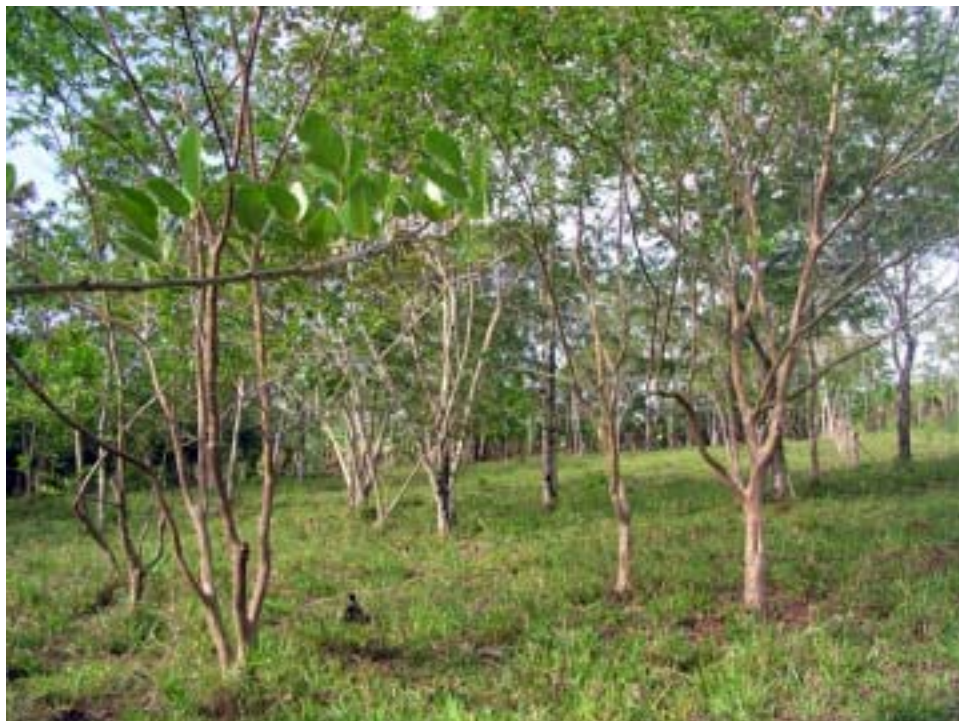
Photo 3: Improved pastures with high tree cover in Matiguás, Nicaragua