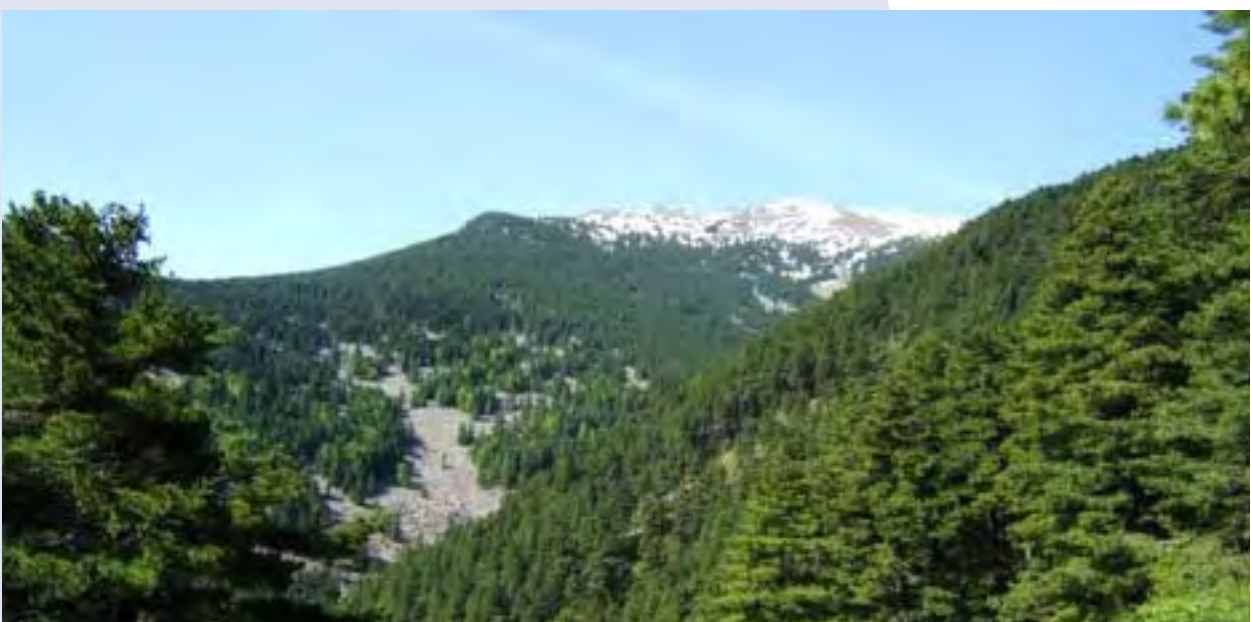
Pelister National Park.