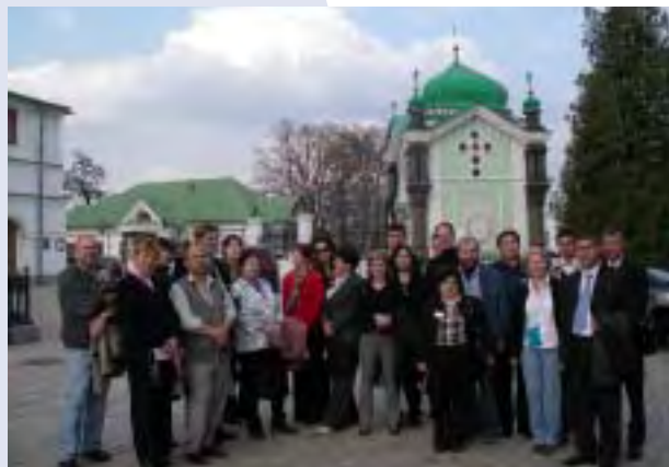
The workshop participants.

Also, the participants discussed bottlenecks and possible solutions regarding biodiversity monitoring in their country. The bottlenecks observed ranged from lack of specialists in certain taxonomic groups, low awareness, difficult accessibility of many areas, and lack of funding for monitoring. Some of the