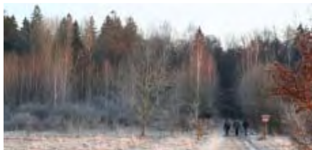
Bialowieza Forest: approaching the Strictly Protected Zone.