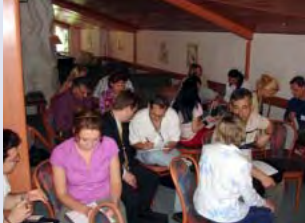
Interactive session in progress.